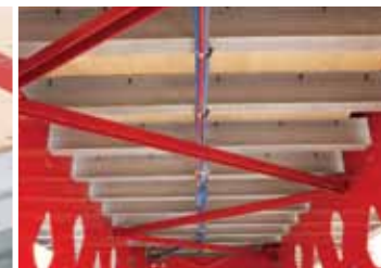
Galvanized steel crossmembers