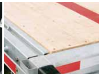
Wood floor available