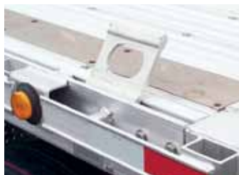
Cargo hands as internal anchor points