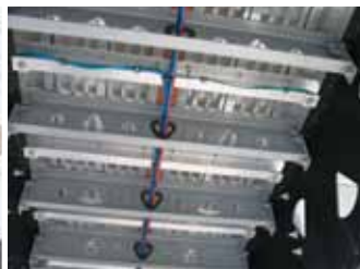
60,000 lb. capacity coil package